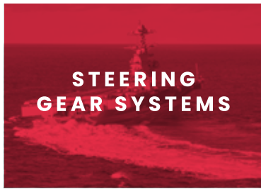
STEERING GEAR SYSTEMS