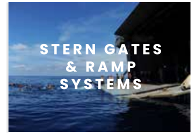
STERN GATES & RAMP SYSTEMS