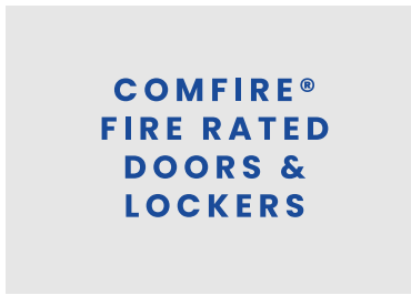
COMFIRE® FIRE RATED DOORS & LOCKERS