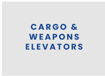
CARGO & WEAPONS ELEVATORS