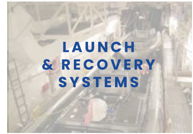
LAUNCH & RECOVERY SYSTEMS