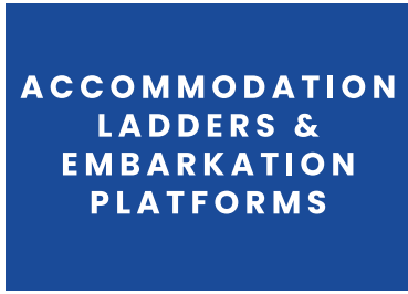
ACCOMMODATION LADDERS & EMBARKATION PLATFORMS